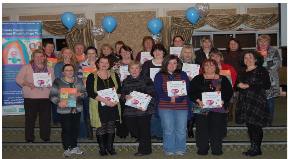
Childcare Staff at the Síolta Awards Celebrations